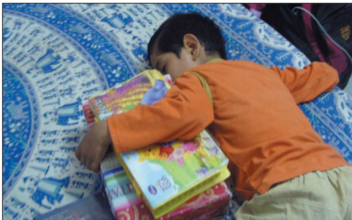
A child sleeping with his box

Will you, your business or group be a part of Operation Christmas Child this year? Above all, will you join us in prayer that God might use the shoe box gifts, Christian literature, and the local churches that facilitate the Operation Christmas Child project in many nations to bring children to faith in Jesus Christ?